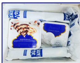
Keeps Ice cream & desserts Cool