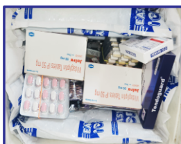
Preserve Medicines cool