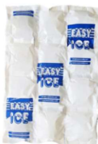
400 gm 11x7 Inch