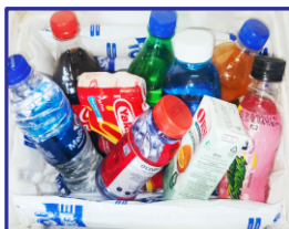
Preserve cool Cold Drinks in Ice Box