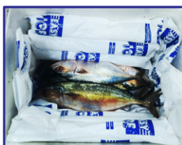
Preserve Sea food in transit