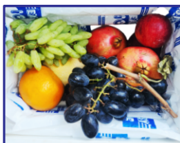
Keep Fruits cool